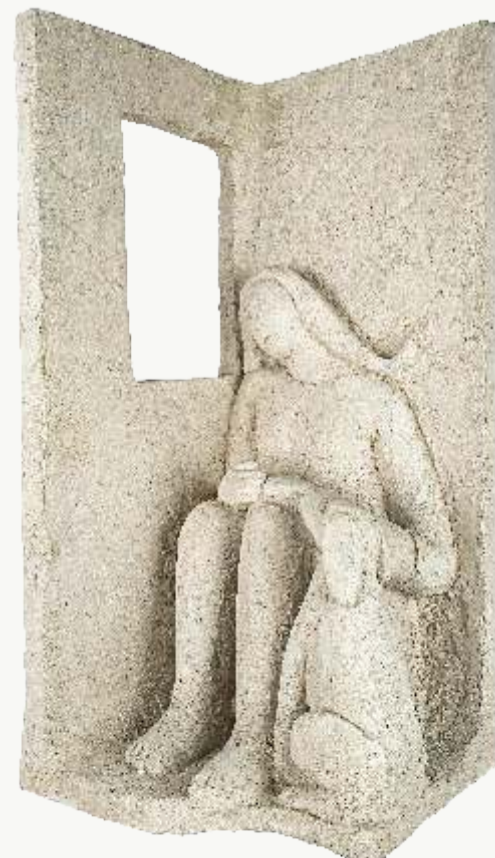
Donna con cane - 1991

Clizia Orlando, from "Silenti creature" ("Silent Creatures"), 2008