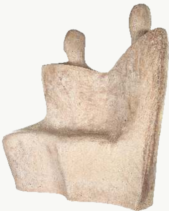
Due Teste - 1998