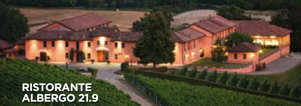
ph. courtesy Ristorante Albergo 21.9